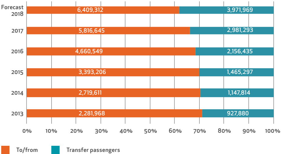
The number of transfer passengers through Keflavik Airport increased proportionally the most.

Facts — Booking data and information from Keflavik International Airport’s flight information system is used to refine the forecast.